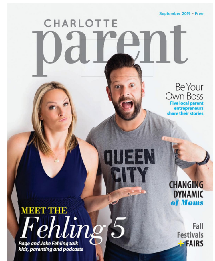
Charlotte Parent Magazine

Three-time winner, "Best TV Personality"