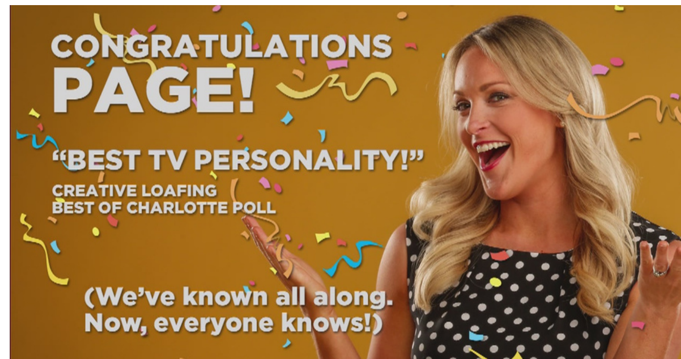
Creative Loafing Best of Charlotte

Three-time winner, "Favorite News Anchor"