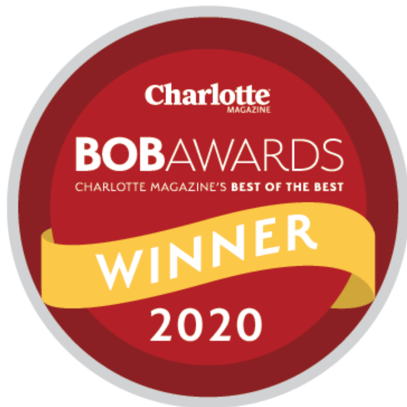
Charlotte Magazine Best of the Best

Wherein Page humble brags with no actual humble. But plenty of brag.